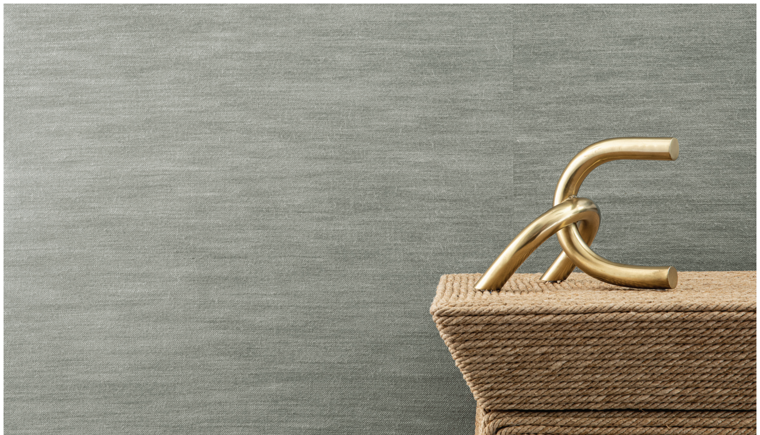
FEATURED W5019/109 LAKE AND CHRISTIAN ASTUGUEVIEILLE LOUXTER CHEST