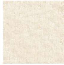
01 SOFT LIGHT