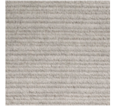
06 WARM SILVER