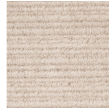
02 NATURAL STATE