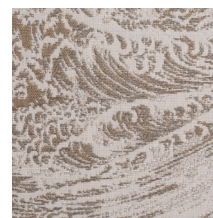
02 SILVER STONE