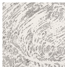
01 OCEAN FOAM

Extensive cleaning instructions available at www.hollyhunt.com .