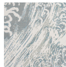
03 BAY BLUE