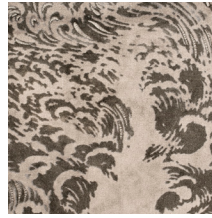
01 BRONZE NIGHT