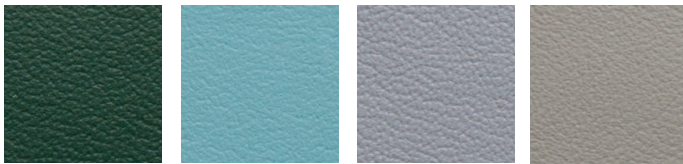
14 BOTTLE GREEN